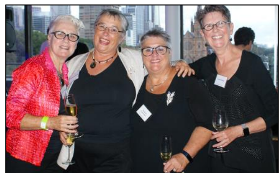
78ers enjoy the Cocktail Party

All events were extremely well attended and received great feedback. For the 40 th Anniversary, members of First Mardi Gras also completed over 40 media engagements including local and international TV, radio, online and print coverage.